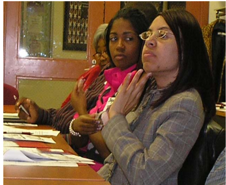
2/22/07 training at NCCU